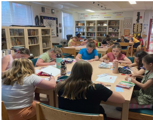
Pictured above school children from Guysborough Academy working on their museum exhibits